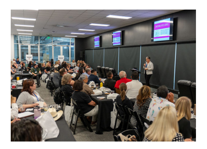
*Includes Conf & Expo sponsorships only; booth pricing to be posted closer to event date